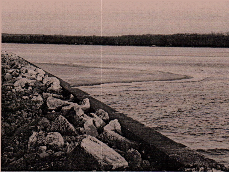
Low Water in January in the Portage Lake-Lake Michigan Channel

Will Be Held the Third Thursday, April 18, 2013, 8 a.m., in the Onেকama Township Hall