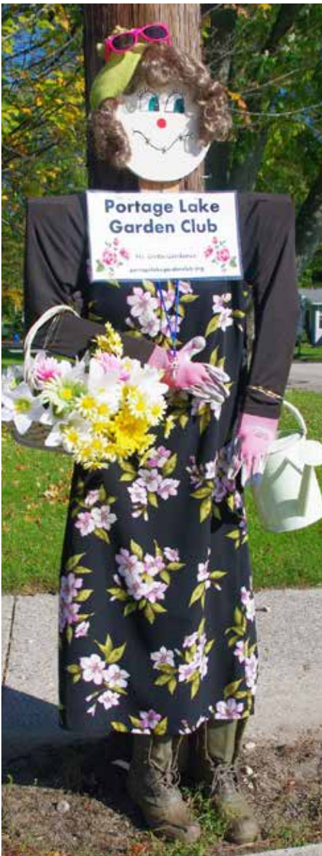
Top 3 Vote Getters